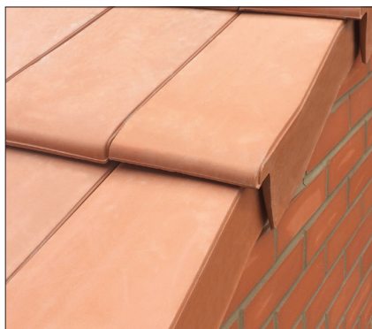
Crest Nelskamp clay right hand cloaked verge.