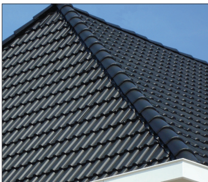
Crest Nelskamp Dry Fixing System.

*As per European trademark Nr.7287956, filed on 2nd October 2008, the Trademark PLANUM belongs to La Escandella. It is Dachziegelwerke Nelskamp as authorized licensee of the owner allowed to use the mark PLANUM for its concrete product.